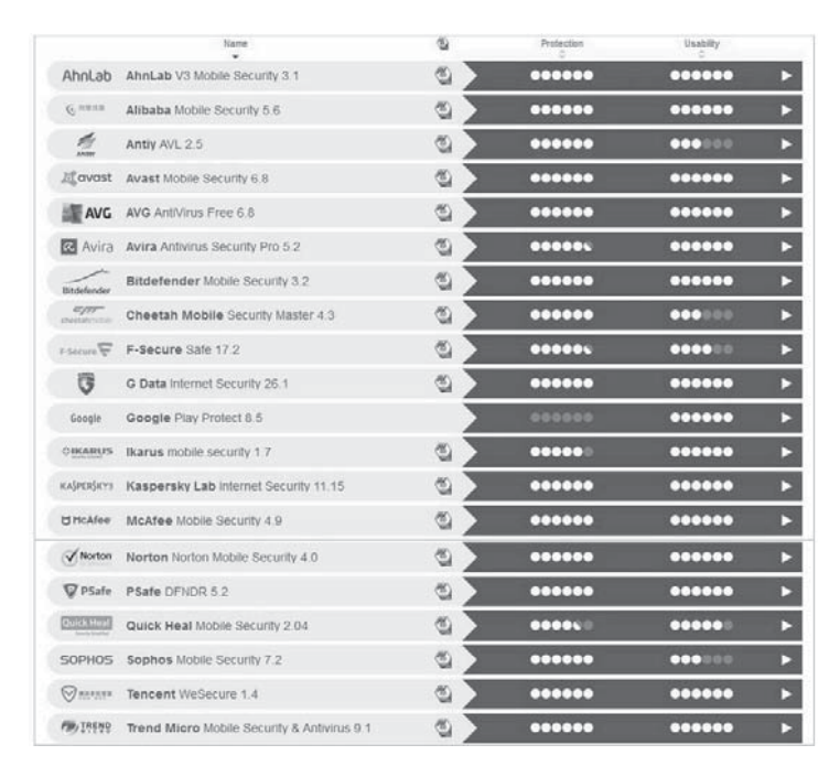
Figure 4. AV-Test results for January 2018