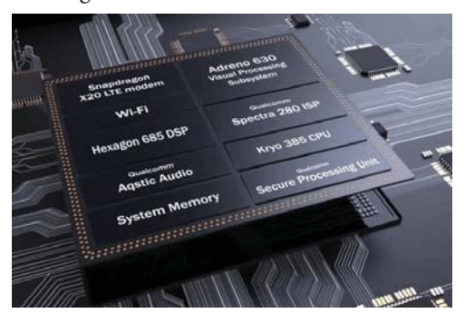
Figure 3. Snapdragon 845 Structure

Snapdragon 845:<sup>8</sup> Includes a hardware isolated subsystem called the Secure Processing Unit (SPU). The SPU is an isolated security-focused processor embedded in the system-on-a-chip. The manufacturer wants to store all that biometric data in the vault-like environment, which is similar to what Apple does on its A11 Fusion processor in the iPhone. The Secure Enclave Processor has its own microprocessor and encrypted memory and it handles ultrasensitive data like Face ID data and decryption keys. The SPU stores similar sensitive data (payment information, SIM information and more) and it is kept separate from other components to prevent hacking.