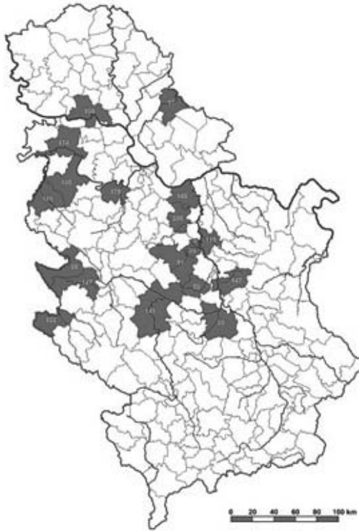
Picture 1. Map overview of geospatial disposition of surveyed correspondents by local communities in the Republic of Serbia