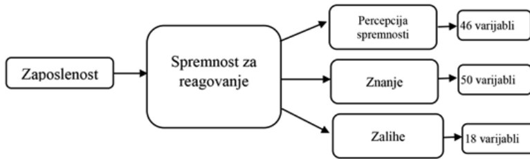
Slika 1: Dizajn istraživanja – operacionalizacija teorijskog određenja spremnosti

Imajući u vidu predmet istraživanja, za realizaciju istraživanja odabrane su lokalne zajednice sa visokim i niskim rizikom nastanka ravničarskih i bujičnih poplava. Shodno uslovima pod kojima se rezultati naučnog istraživanja mogu generalizovati na celokupnu populaciju građana Srbije, istraživanje je sprovedeno na teritoriji većeg broja lokalnih zajednica različitih po svojim demografsko-socijalnim karakteristikama. Obuhvaćene su gradske i seoske lokalne zajednice u različitim delovima Srbije: Obrenovac, Šabac, Kruševac, Kragujevac, Sremska Mitrovica, Priboj, Batočina, Svilajnac, Lapovo, Paraćin, Smederevska Palanka, Jaša Tomić, Loznica, Bajina Bašta, Smederevo, Novi Sad, Kraljevo, Rekovac i Užice (Slika 2).