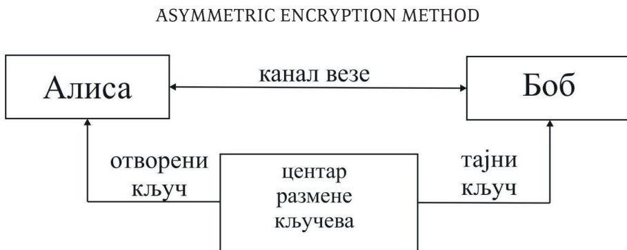
Figure 2. Structure of asymmetric cryptosystems 5

The problem has been successfully solved within modern cryptography. There are two ways to solve the key distribution: mathematically and physically. The mathematical method is realized by using a two-key based protocol or public-key cryptography. The physical way is realized by means of quantum cryptography.