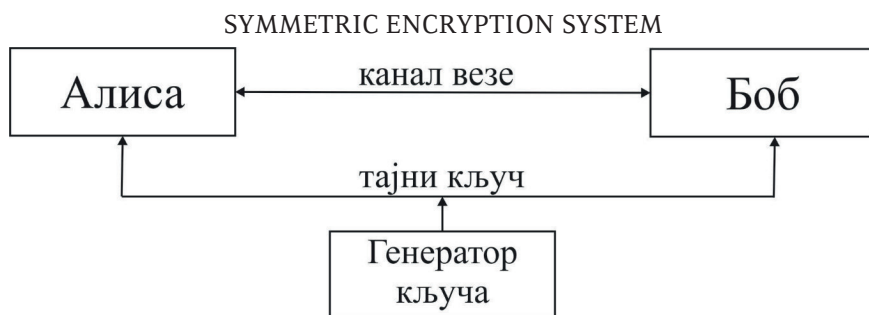
Figure 1. Structure of symmetric cryptosystems 4

The primary task of cryptography is to transform an initial text (plaintext) into an arbitrary string of characters called a cryptogram. The number of characters in the plaintext and the cryptogram may differ. The secrecy of the encryption algorithm itself cannot, in principle, ensure the unconditional security of the cryptograms, as it is assumed that Eva (the enemy) has infinitely large computer resources. Therefore, public key algorithms are used nowadays. The security of modern cryptosystems is based on the secrecy of a small item of information called a key, rather than on the secrecy of an algorithm. The key is used to manage the encryption process and should be easily changeable at any time. At the end of the nineteenth century, the Dutch scientist Kirchhoff formulated a rule by which the security of a key is ensured if the entire encryption system, other than the secret key, that is, the information that manages the process of cryptographic transformation, becomes known to the enemy, (Kilin, Horosko & Nizovcev, 2007).